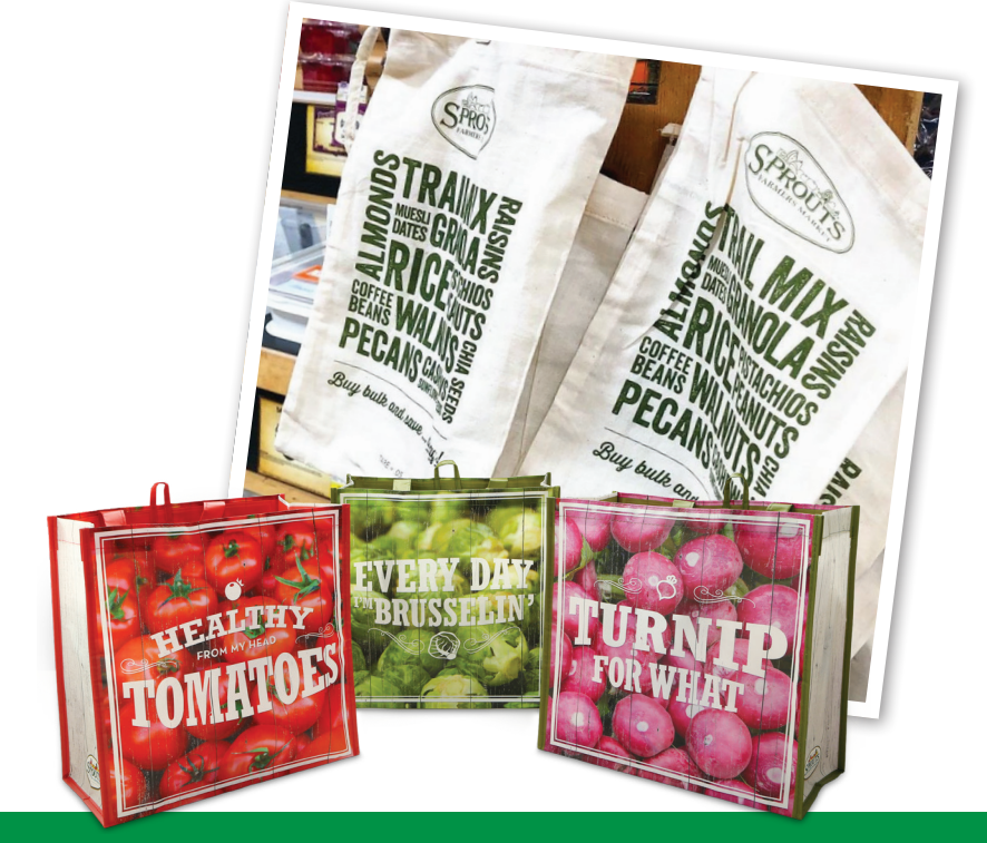
IN 2019, SPROUTS SHOPPERS RECEIVED MORE THAN $1,300,000 IN CREDIT FOR SHOPPING WITH REUSABLE BAGS!