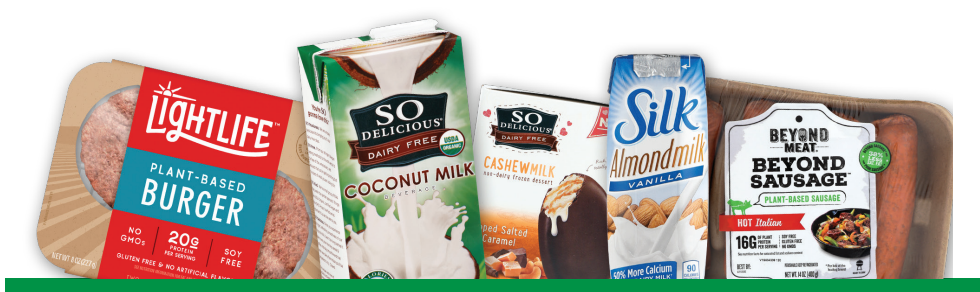
IN 2019, SPROUTS' MEAT DEPARTMENT INCREASED PLANT-BASED PROTEIN SALES BY 1,400%.

Sprouts is the go-to grocer for first-to-market, plant-based products from dozens of leading and emerging brands, such as Beyond Meat, Califia, Silk, and Pure Farmland. Shoppers trust these cutting-edge, plant-based products to meet the needs of flexitarian, plant-based, and vegan diets, or while simply shopping in a way that can reduce their carbon footprint.